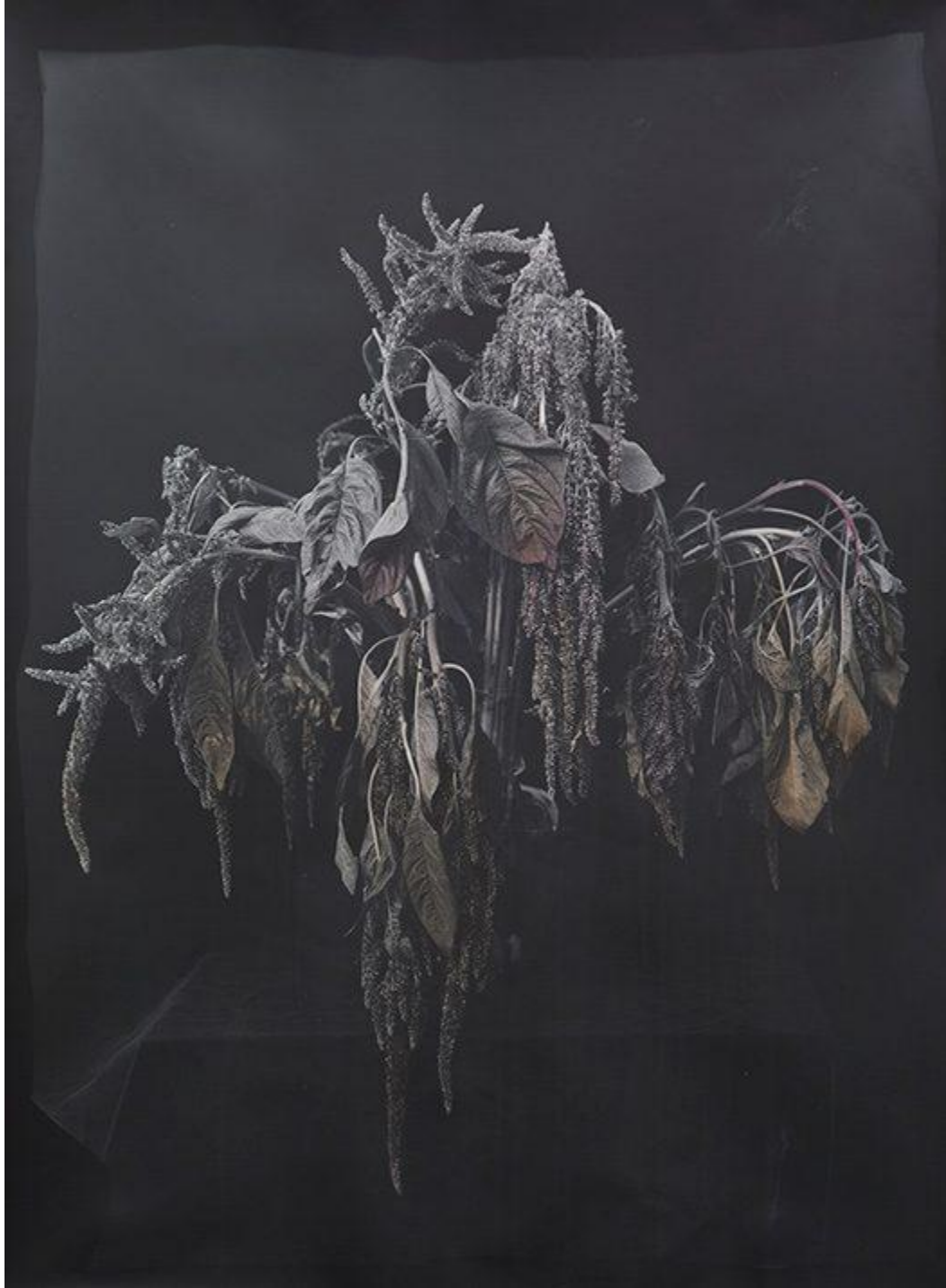
"Amaranth," 2016, silver gelatin print colored with amaranth dye.