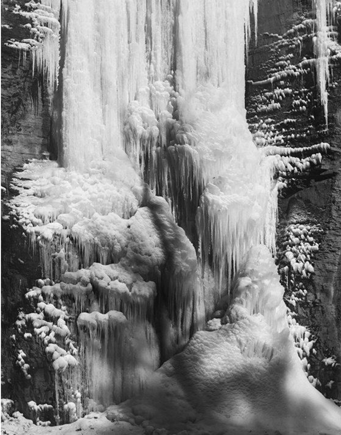
"Frozen Waterfall," 2015, silver gelatin print.