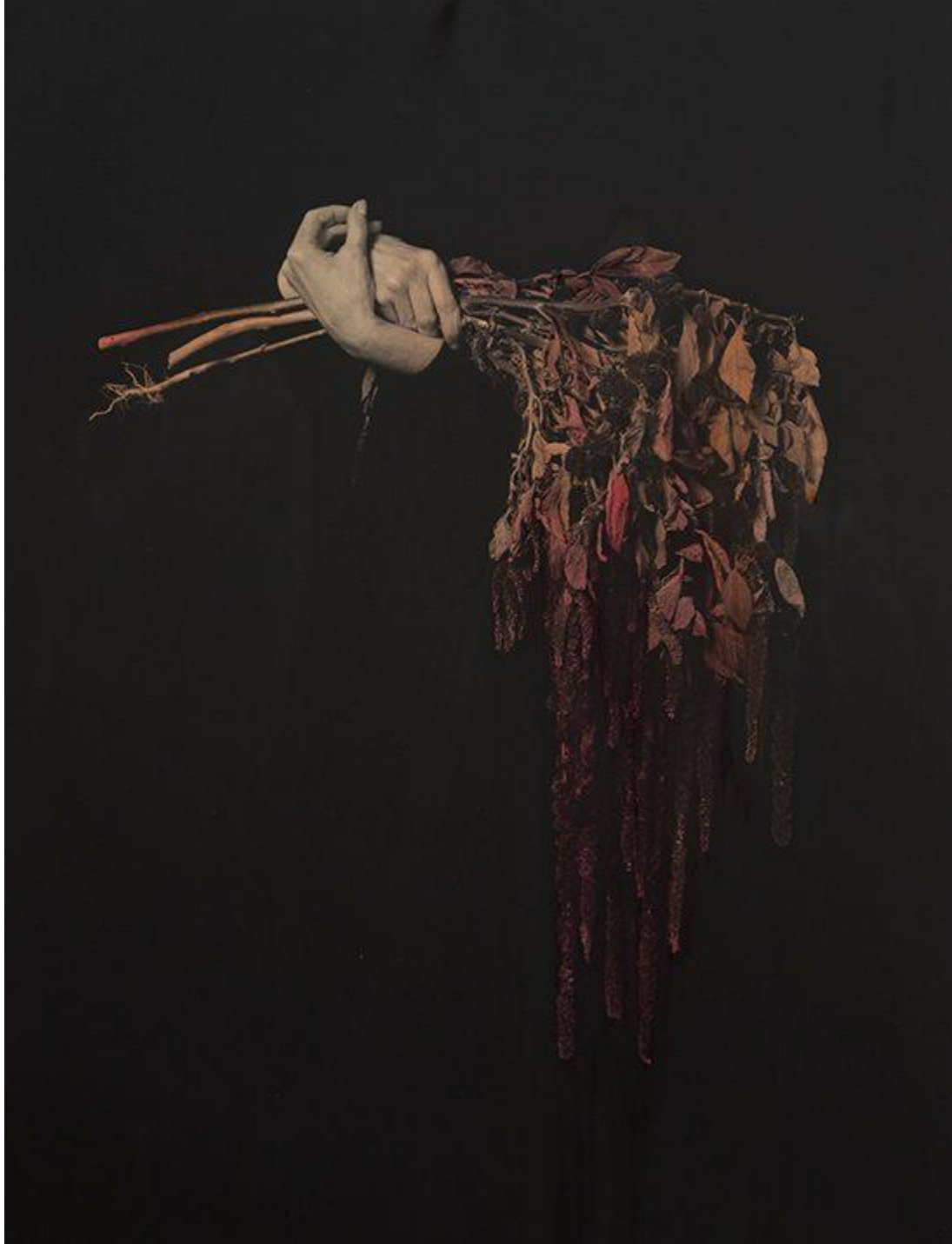
"Amaranth Extraction II," 2016, silver gelatin print colored with amaranth.