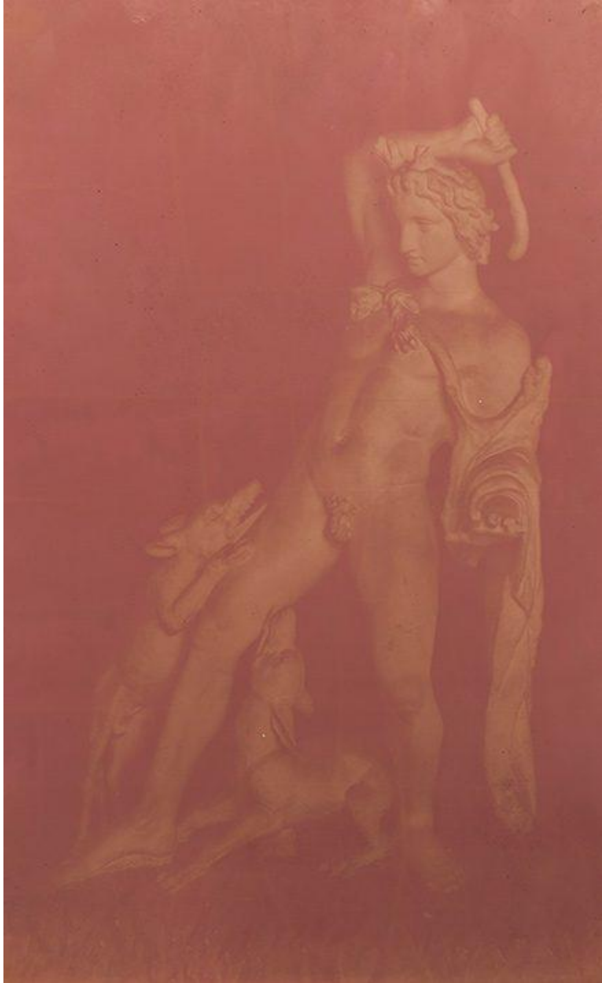
"Actaeon attacked by his hounds," 2016, amaranth on paper.