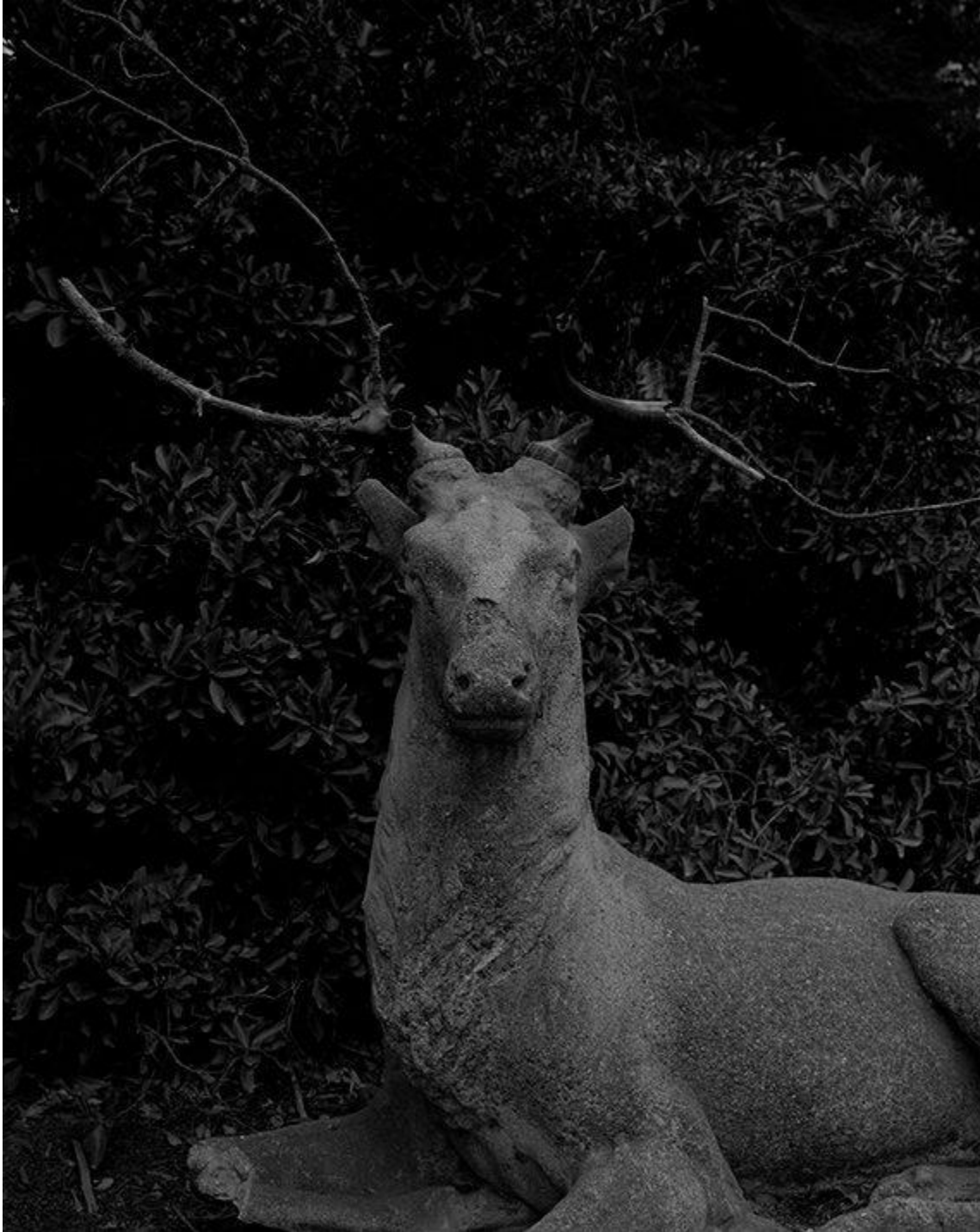
"Actaeon as Stag," 2014, silver gelatin print.