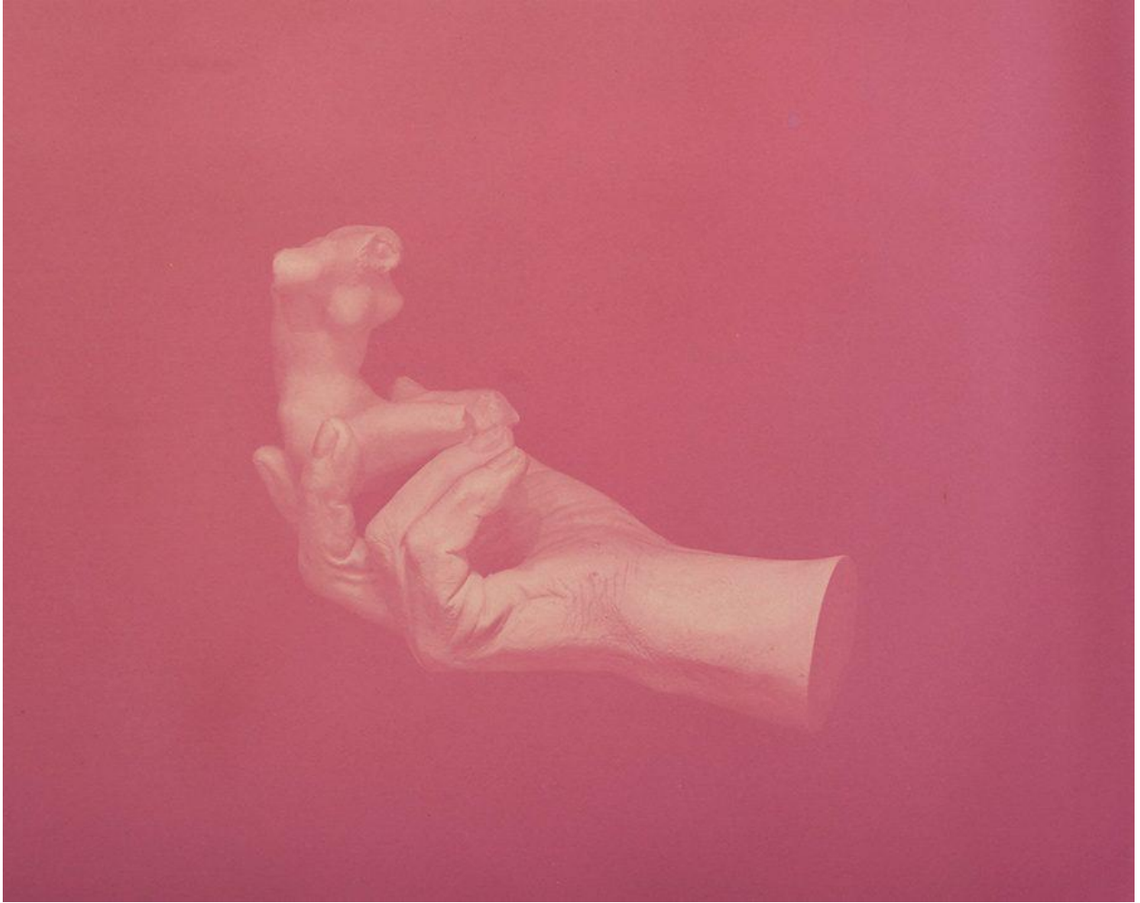
"Hand of Rodin Holding a Torso," 2016, amaranth on paper.