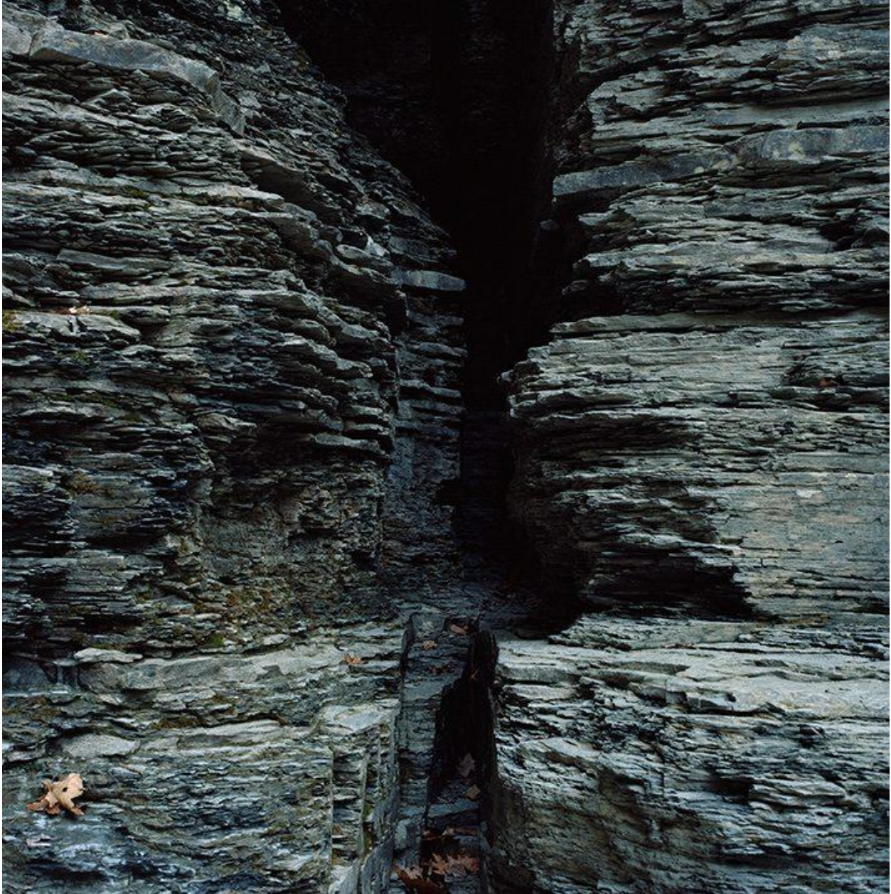
"Devil's Kitchen," 2016 Pigment print.