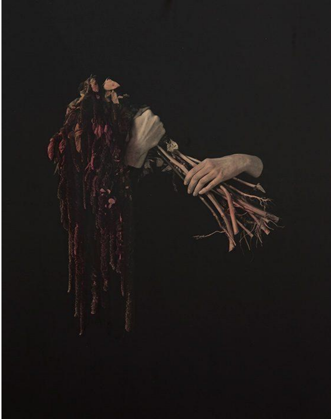
"Amaranth Extraction I," 2016, silver gelatin print colored with amaranth.