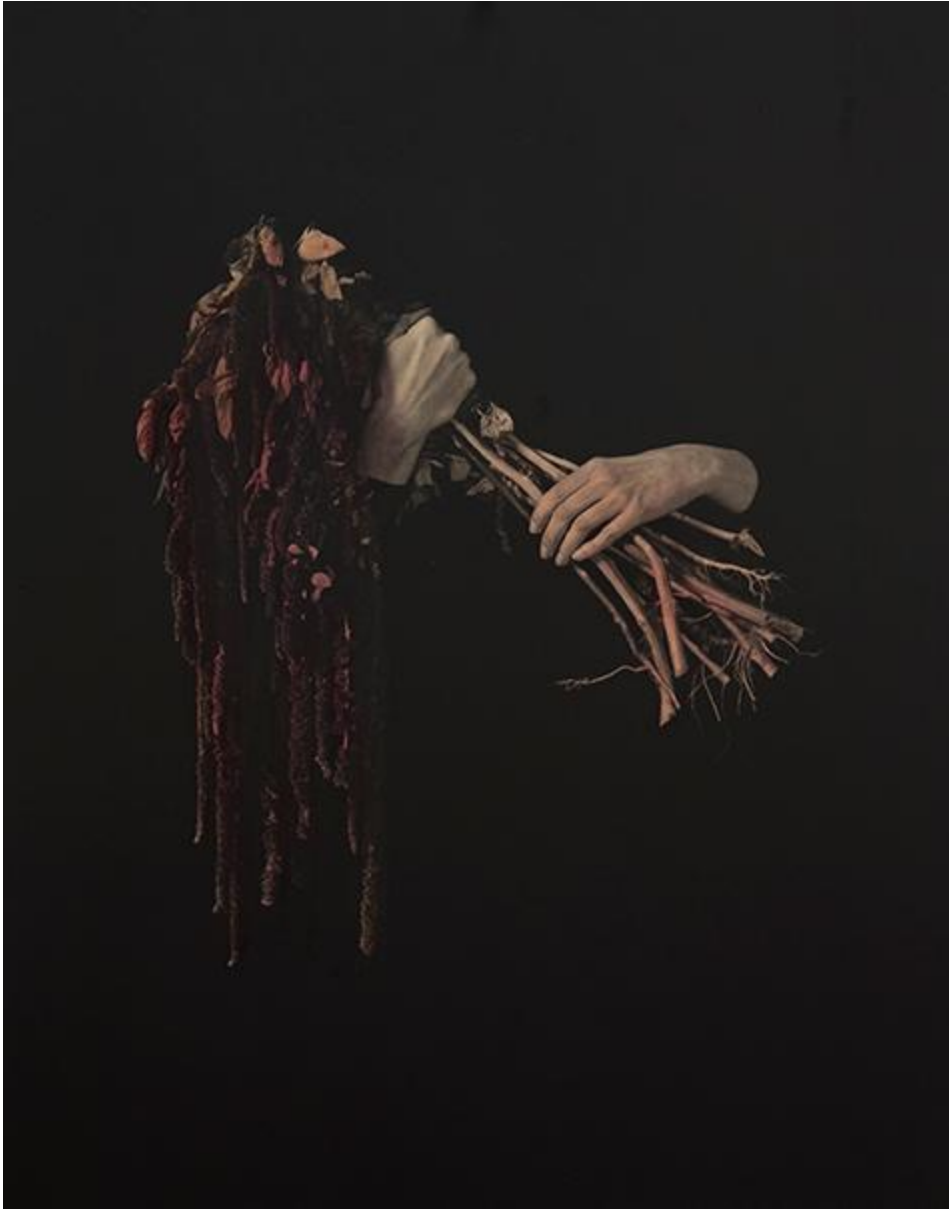
Amaranth Extraction I, 2016. Silver gelatin print colored with amaranth, 17.5 x 13.5 inches. Edition of 3 + 2AP.