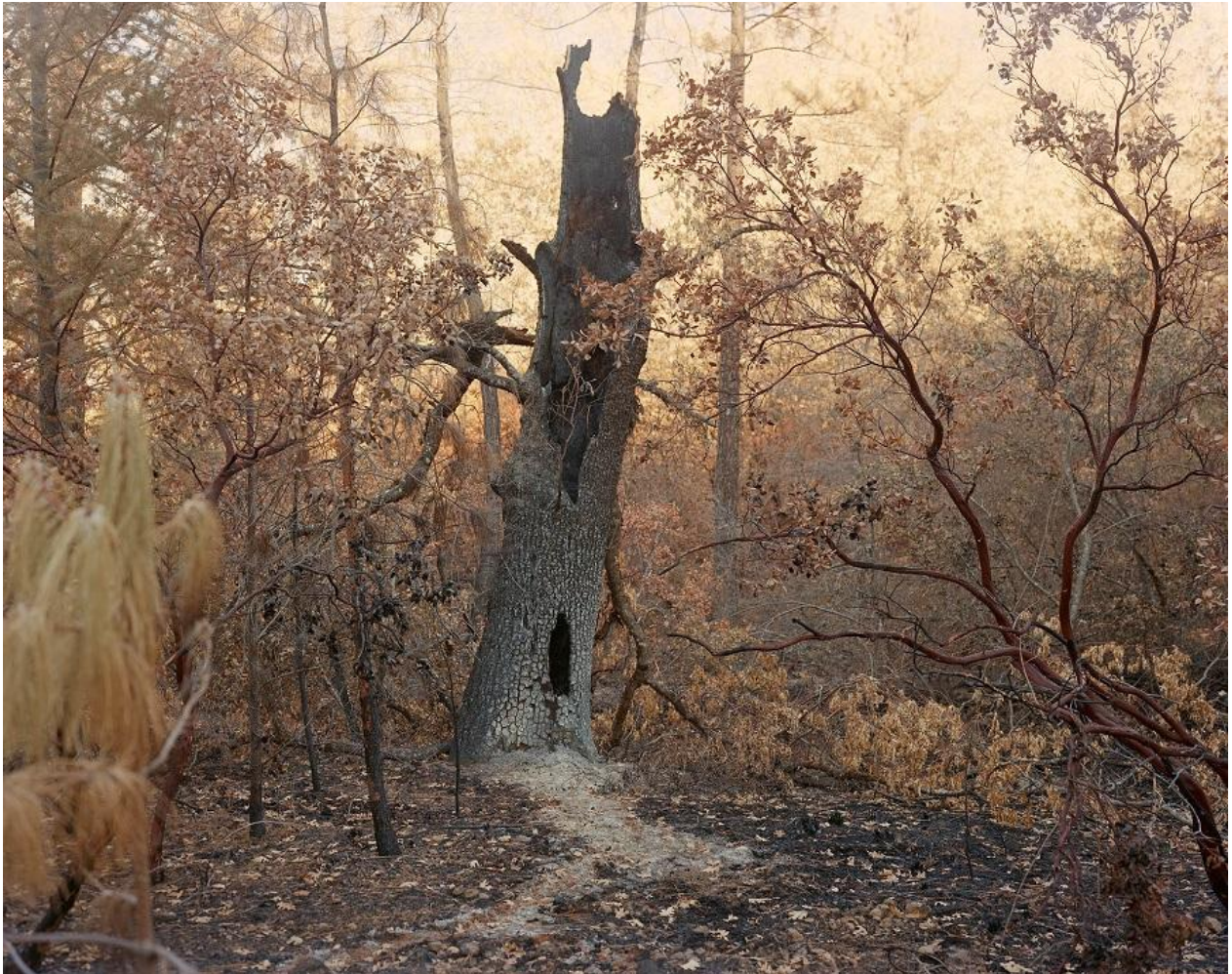
Ash, 2015, Pigment print, 40.5 x 51 inches. Edition of 3 + 2AP.