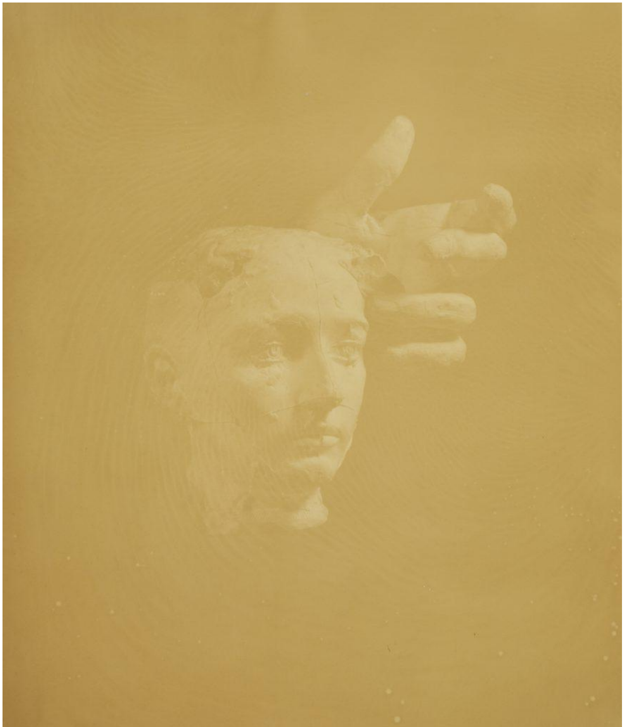
Mask of Camille Claudel, 2016. Amaranth on paper, 16 x 20 inches. Edition of 3 + 2AP.